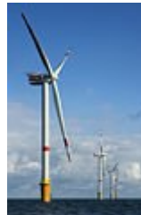
REpower 5MW wind turbines D4 (nearest) to D1 on the Thornton Bank