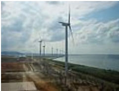
Wakamatsu wind farm, Kitakyushu, Japan