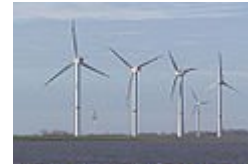
Very large prototype wind turbines by REpower and Enercon on a test field in Cuxhaven