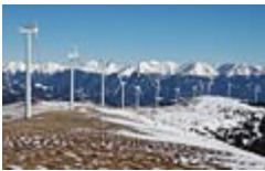
Vestas V66-1.75MW wind turbines of the Tauern Wind Park near Oberzeiring