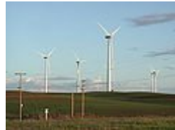
General Electric Wind turbines in Solano County, CA