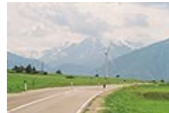
Leitwind wind turbine on Reschen Pass in Mals, Trentino-Alto Adige/Südtirol