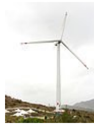
The Nordex N50 wind turbine and visitor centre of Lamma Winds in Hong Kong